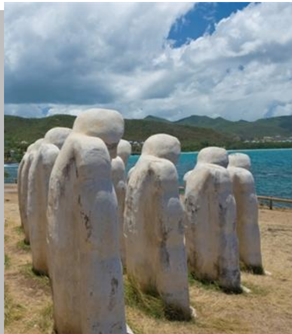
Cafard Anse Slave Memorial: These 20 effigies near Diamond Rock commemorate an 1830 slave ship sinking. This year's ACH coincides with the anniversary of the abolition of slavery in the French Antilles in May of 1848.

Centre international de Séjour : http://www.french.hostelworld.com/hosteldetails.php/Centre-International-de-Sejour-Martinique/Fort-de-France/29033