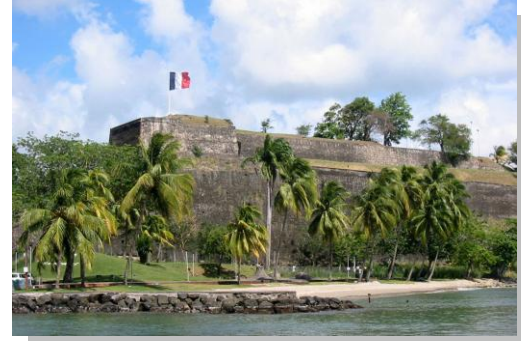
Historic Fort St. Louis in Fort-de-France

The 46 th Annual Conference of the Association of Caribbean Historians will be held in Fort-de-France and Schœlcher in Martinique from Sunday, May 11, to Friday, May 16, 2014. Registration will open on Sunday afternoon, and sessions will begin Monday morning.